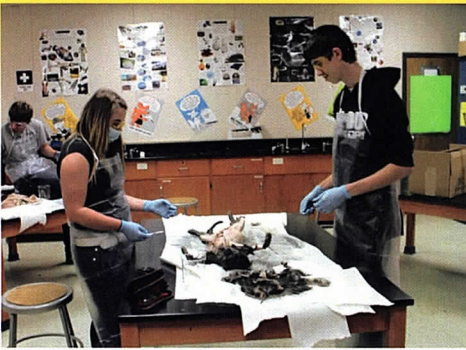
H.S. Anatomy Students